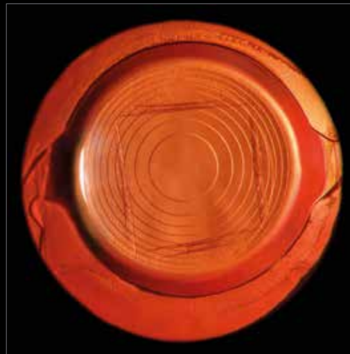
Capsulotomy, Ellex – Step 1: multifocal lens

Employing TCI™ to identify capsular fragments, Tango Reflex™ can be used to vaporize broken pieces of the fragment and help prevent the common problem of sudden post-capsular floaters post treatment.